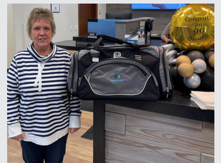
Cheryl O. Travel Bag